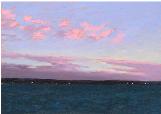
Sarah Butterfield June 2016 Sunrise in The Solent VI oil on board, 18 x 25 cm