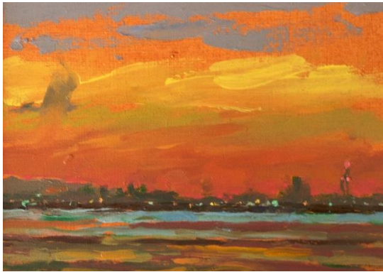
Sarah Butterfield January 2010 Evening in The Solent VI oil on board, 13 x 18 cm