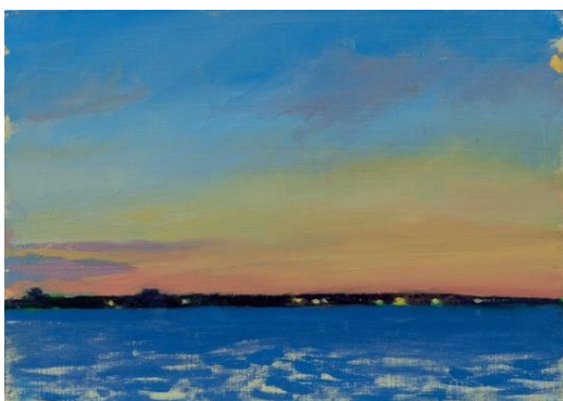
Sarah Butterfield Sunrise in the Solent 6, February 2016 ©The Artist

Petersfield Museum and Art Gallery is delighted to announce the opening of Sarah Butterfield: Dusk and Dawn in The Solent on 24 November 2023. Butterfield's expressive paintings explore the changing quality of light and colour at dusk and dawn over The Solent, Hampshire. The Solent is the body of water that separates the Isle of Wight from the mainland of England, along the Hampshire coast.