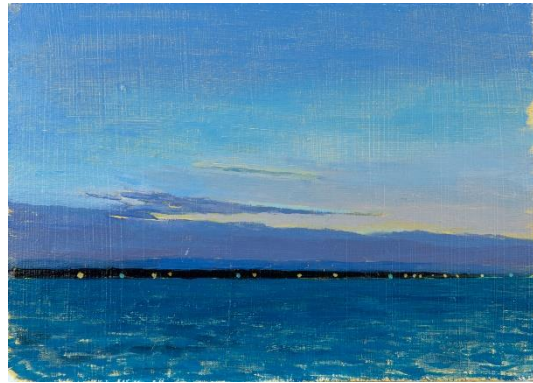
Sarah Butterfield April 2017 Sunrise in The Solent 62 oil on board, 13 x 18 cm ©The Artist